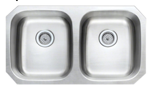
Style: Double Equal Bowl

Outside: 23-3/8" x 17-3/4" Inside: 21-3/8" x 15-3/4" x 8"D