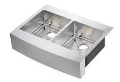
Style: Farmhouse Double Bowl