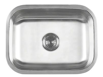
Style: Single Bowl Model# SIN-18-SINBWL-2318

Outside: 23-3/8" x 17-3/4" Inside: 21-3/8" x 15-3/4" x 8"D