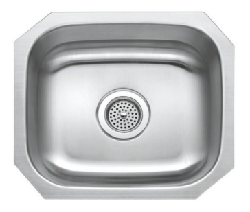
Style: Single Bowl Bar Sink Model# SIN-18-SINBWL-1618

Outside: 18" x 16" Inside: 16" x 14" x 8"D