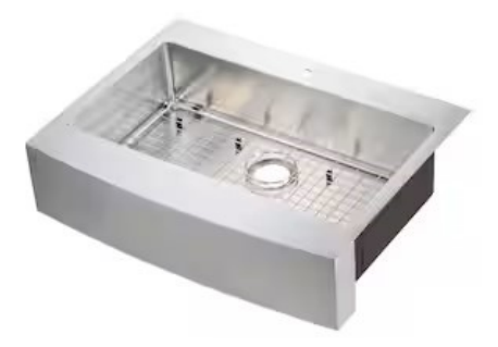
Style: Farmhouse Single Bowl

Left Inside: 14-1/2"x16-1/2"x8"D Right Inside: 14-1/2"x16-1/2"x8"D