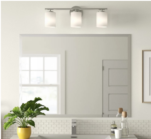
Polished edge mirror & light bar